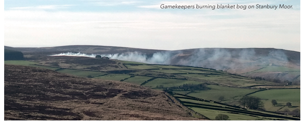
Gamekeepers burning blanket bog on Stanbury Moor.

Rather than automatically renewing shooting licences – as had been the case – Yorkshire Water has committed to stringently reviewing every lease as it runs out. Based on the grounds the company has set out, it is our view that no more leases will be renewed.