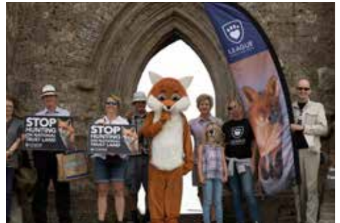
League supporters raising their voices for animals at Glastonbury Tor.

To help raise awareness of 'trail' hunting on National Trust land, we have been holding picnics as an education opportunity – a way of celebrating the beauty of wildlife and raising awareness of the need to protect it.