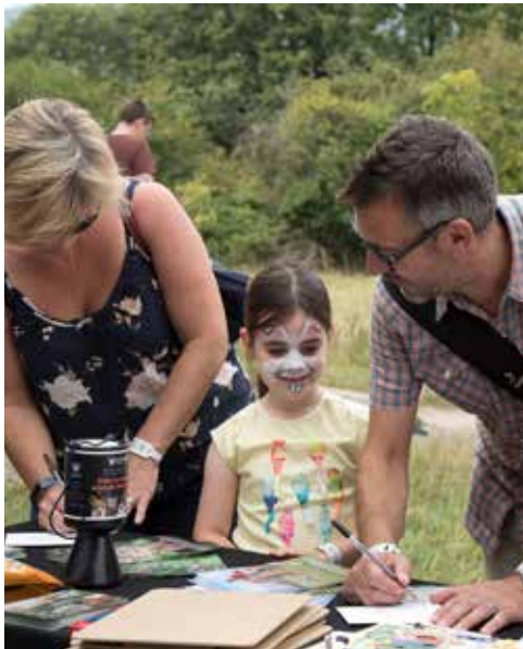
League picnics provide a wonderful education opportunity.

The League has been campaigning for the National Trust to stop licencing 'trail' hunting on its land, as 'trail' hunting is nothing more than a cover for animal cruelty. Since then, increased publicity and pressure generated by us and you, our supporters, meant the number of National Trust licences applied for in 2018 was down by two-thirds on the previous year. But we haven't stopped there.