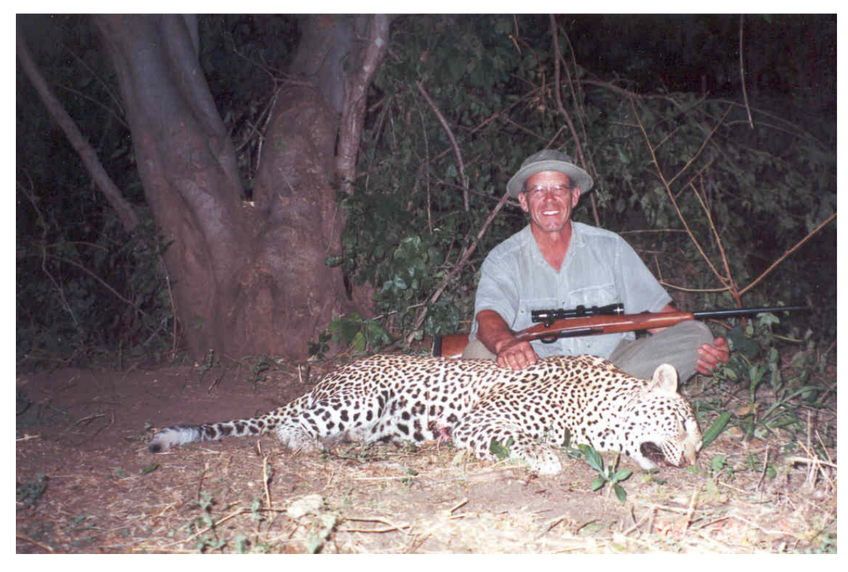
"It goes without saying that importing trophies of endangered species should be banned by the British Government. I'm really shocked that they haven't already done it. The whole world should do it." Johnny Rodrigues, Zimbabwean Conservation Task Force

A League Against Cruel Sports submission to Environment Minister, Elliott Morley MP