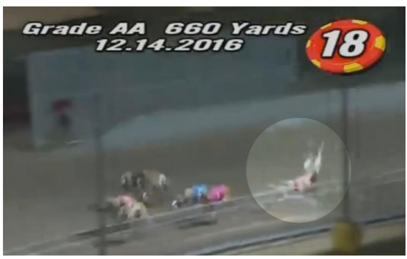
A dog falls at a race track in the United States

At dog tracks worldwide, greyhounds routinely suffer serious injuries. However, only a few jurisdictions regularly publish injury data. The racing commissions of the American states of Arkansas, Iowa, Texas, and West Virginia produce injury data subject to public request, and the Australian state of New South Wales started publishing injury data in late 2015. Reported injuries include broken legs, crushed skulls, seizures, paralysis, broken backs, and death by electrocution.