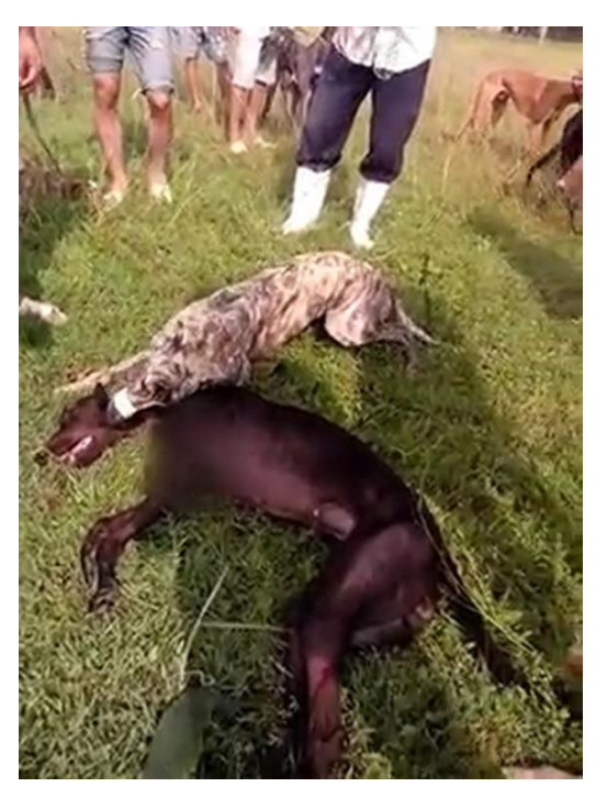
Dogs poisoned to death after racing in Vietnam

Once numbering over 100, Australia's tracks have continued to close.<sup>88</sup> Today, the country has sixty-five greyhound tracks, the most recent one closing in December 2016.<sup>89</sup>