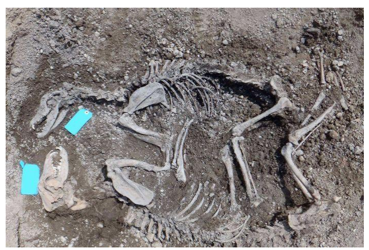
Greyhound skeletons in a mass grave in Australia

In New South Wales, Australia, a 2016 Parliamentary investigation into the greyhound industry revealed evidence that suggests as many as 68,448 greyhounds had been killed over a twelve-year period because "they were considered too slow to pay their way or were unsuitable for racing." A few days after this analysis was released, a greyhound mass grave was discovered at the Keinbah Trial Track near Cessnock. Almost 100 greyhounds had been killed there "with a blow to the head, from either a gunshot or a blunt instrument."