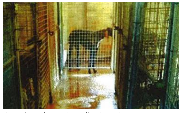
A greyhound in an Australian kennel

Greyhounds are "turned out" two to five times per day, depending on the jurisdiction. At the Canidrome in Macau, dogs are let out twice a day to relieve themselves but stay in their cages for upwards of twentythree hours a day. 15 In the United States, dogs are confined for twenty hours or more with intermittent turn outs and races about once every four days. 16