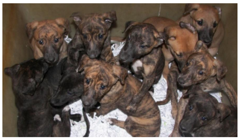
Puppies from a breeding farm in the United States

Using the conservative estimate of six pups per litter, the industry bred approximately 18,036 greyhounds that year. In 2015, only 11,732 were registered to race, a discrepancy of 6,304 dogs.<sup>10</sup> Australia regularly exports greyhounds to New Zealand, having exported 813 greyhounds between 2009 and 2012. 11 In addition, it is estimated that since 2011, Australian trainers have also exported over 1,700 dogs to mainland China, Macau, and Vietnam, jurisdictions with no animal welfare laws in place. 12