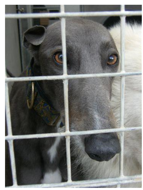
A racing greyhound in Ireland