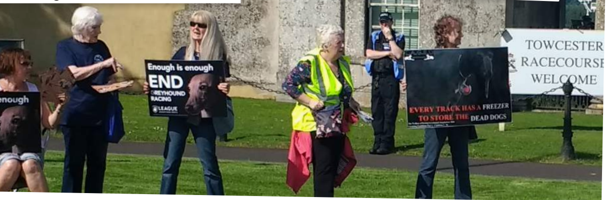
Protesting at the Towcester greyhound derby