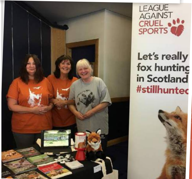
Really banning fox hunting in Scotland

Warning against the disease risk of hunting hounds at Halifax Agricultural Show