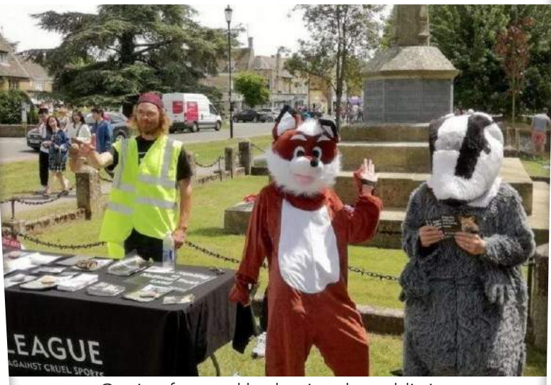
Getting foxy and badgering the public in Bourton-on-the-Water