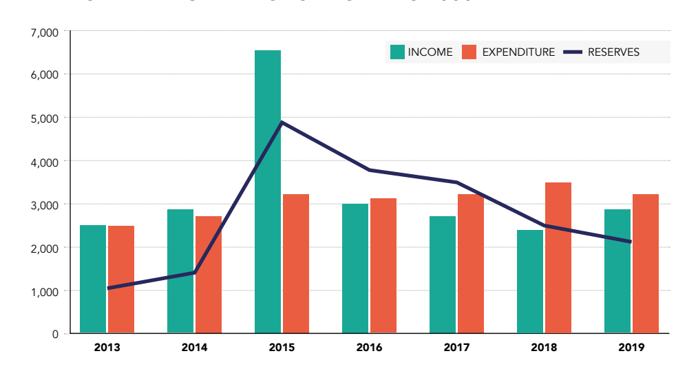
For more detailed information on the League's 2019 finances please refer to the 2019 Annual Report and Financial Statements available on our website