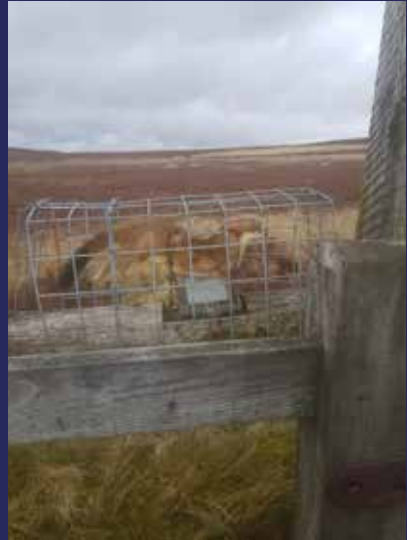
A stoat caught in a Fenn trap

As of the 1 April 2020, Fenn traps can no longer legally be used to trap a stoat.