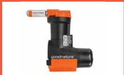
Goodnature A24 Trap

These are approved under General Licence