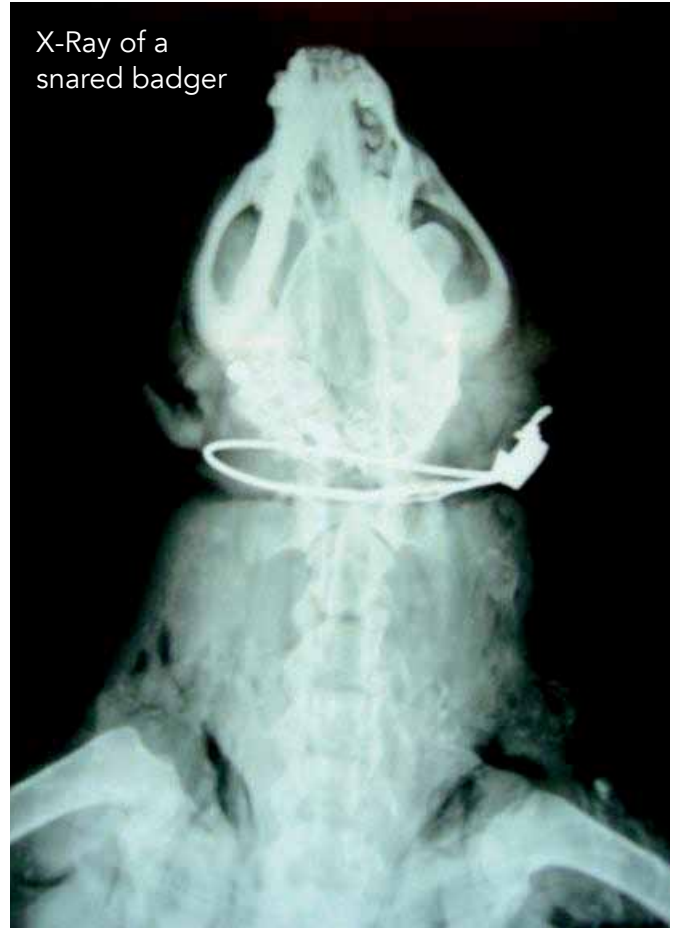
X-Ray of a snared badger

It is time for a complete ban on the manufacture, importation, sale and use of snares to end the suffering of millions of animals caught in them every year.