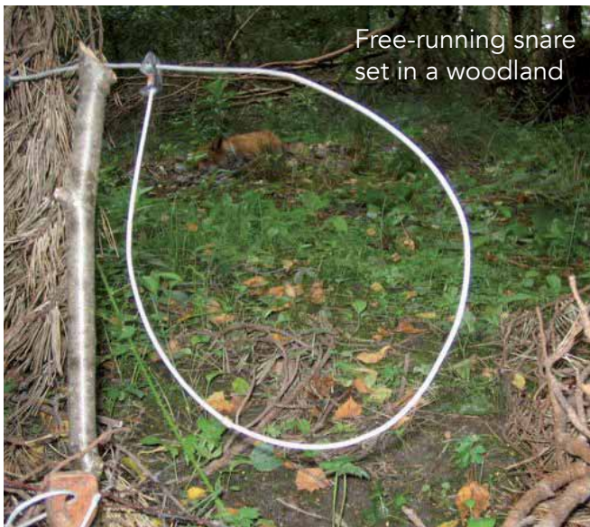
Free-running snare set in a woodland