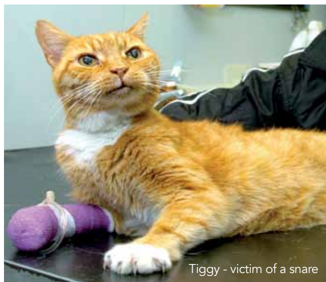
Tiggy - victim of a snare

The number and diversity of animals that fall victim to snares are immense. Defra’s 2012 report outlines two field studies using fox snares where a total of 62 animals were caught in 1,915 snare days, a capture rate of one animal in every 31 snare days. Assuming a similar capture rate for the 53.5 million snares days in England and Wales, around 1.7 million animals are trapped in these primitive devices every year. Moreover, because snares capture any animal that happens to step into them, little more than a quarter of the animals trapped in Defra’s studies were foxes – the intended victims. The other three quarters included hares (33% of all captures), badgers (26%) and a further 14% described only as ‘other’. Media reports and public testimony show that the ‘other’ species regularly caught in snares include cats, dogs, deer and even otters.