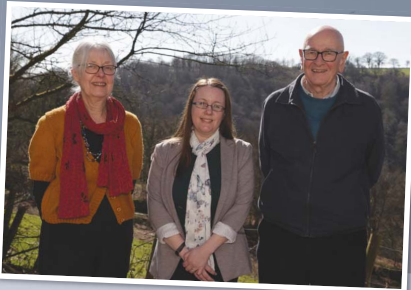
Story by the League Against Cruel Sports

If you would like to join a supporter group visit www.league.org.uk/volunteer