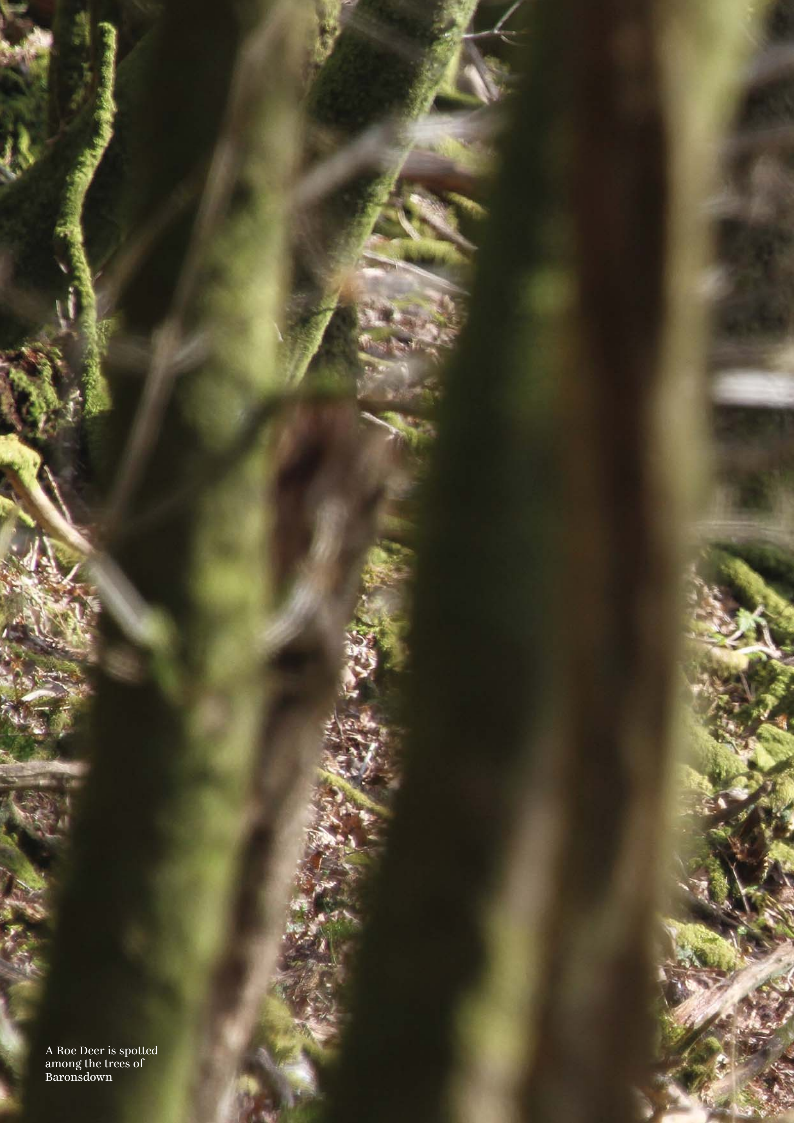
A Roe Deer is spotted among the trees of Baronsdown